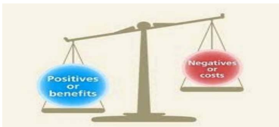
Figure 1 Image of weighing scales illustrates the essence of CBA

CBA produces simple measures to gauge the attractiveness of an investment decision, notably benefit-cost ratio (BCR) and net present value (NPV). Such measures lead to simple decision rules for whether or not to proceed with an investment or intervention, based on whether or not it delivers net benefits. Using this criterion, the basic decision rule for whether or not to proceed is BCR > 1 or NPV > 0 . Critically, however, these measures can be used to compare competing investment options based on which promises to deliver the greatest benefits for the lowest costs.